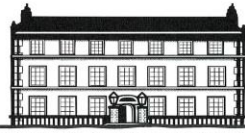
Spring at The Judges' Lodgings Museum

Easter Holiday Craft Workshops £2 per child Cracking good family fun on Fridays in the Easter holidays. No booking required. Drop-in between 11am - 12.30pm and 1pm - 3.30pm.